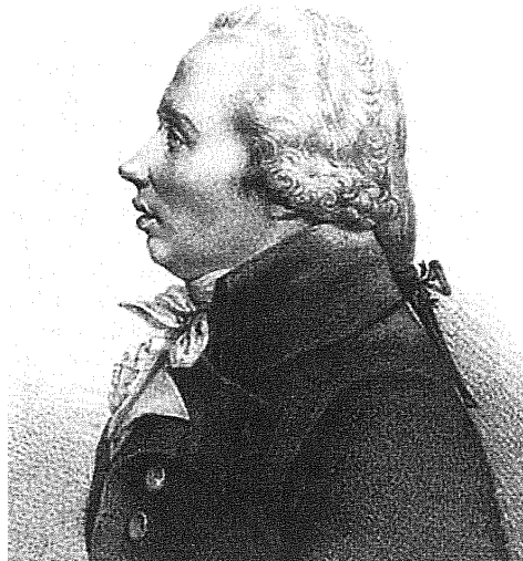
Figure 2: Adrien-Marie Legendre

more flattering and less equivocal way that the attractions of that science, which have added so much joy to my life, are not chimerical, than the favor with which you have honored it.